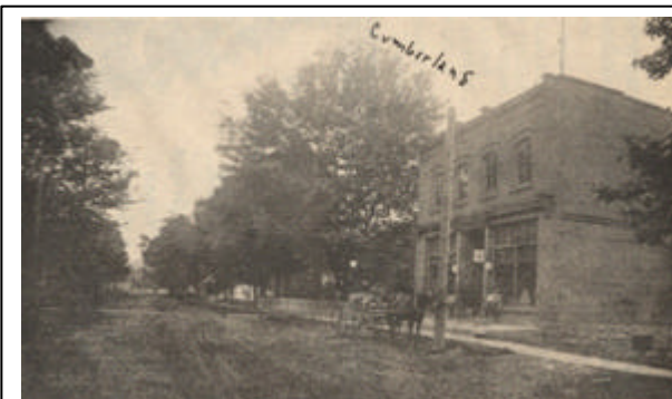
Dunning's store on Queen Street, Cumberland Village